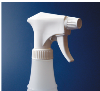
Non-Aerosol Fully assembled ready-to-use Trigger Spray/Bottle.