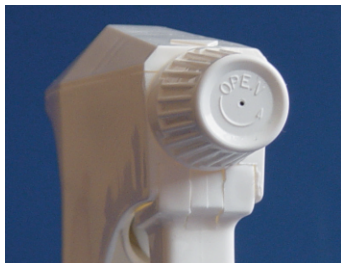
Adjustable Non-Aerosol Trigger Spray to choose a stream for precise application or coarse spray for large areas.