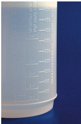
Graduated Spray bottle for precise dispensing.